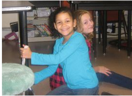
Cleaning Tables at School.

One way our students show their appreciation for being able to attend a donation-based school is that they engage in various service-work projects throughout the year. Recently, we divided them into three groups to tackle three distinct assignments: one group not only made dinner to bring to the guests staying at the Ronald McDonald House, but they also cleaned the facilities and brought donated items; another group remained at school to clean the tables in fellowship hall, the classrooms and cabinets; the third group went to do yardwork to help one of our families which is struggling with health concerns. Let me tell you - if you need a work crew, we have some students who can do as good a job as any adult! We are SOOOOO proud of what they have done - and the servant attitudes that were displayed.