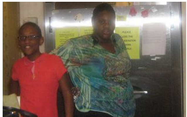
Cleaning the Ronald McDonald Kitchen