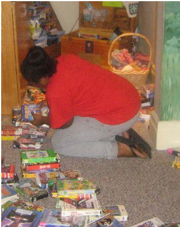
Sorting videos at Ronald McDonald House

Believe me when I say - these past 4 years have taught us MUCH about trusting the Lord to provide - He alone is our Jehovah Jireh!!! BUT - He uses His living body of Believers to provide what His ministries on earth require! Can I challenge you to pray about how the Lord might use you to help EWA move forward - knowing that you would be making an investment that has not only temporal benefits, but eternal ones as well! By your generous giving, (and for some we know it is sacrificial giving), the students are learning the Biblical principles regarding: developing a good work ethic so that they can someday help someone else in need; being thankful for how the Lord cares for us; giving sacrificially to the Lord and trusting Him to provide; that it is truly more blessed to give than to receive. They learn these truths through our giving them "snapshots" of people we personally know who are supporting EWA!