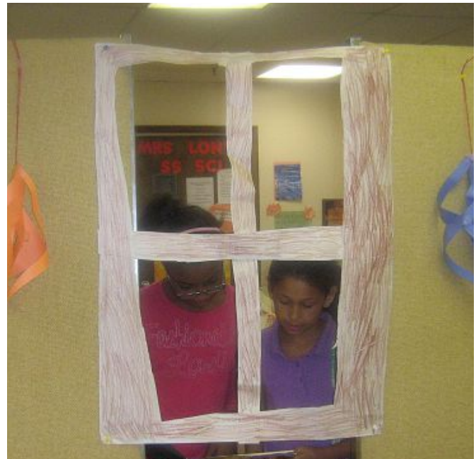
Students make a window for a commercial set